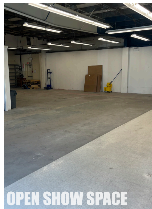
OPEN SHOW SPACE