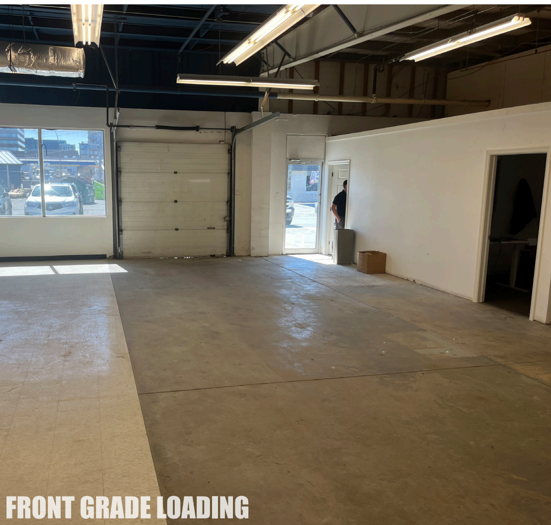
FRONT GRADE LOADING