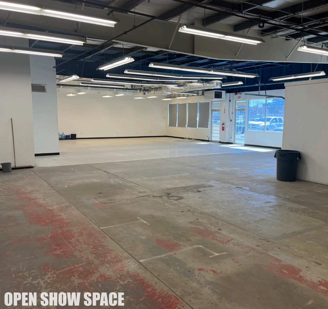
OPEN SHOW SPACE