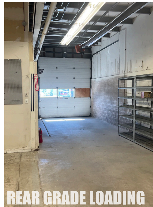
REAR GRADE LOADING