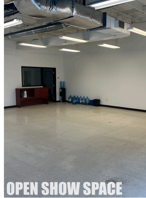
OPEN SHOW SPACE