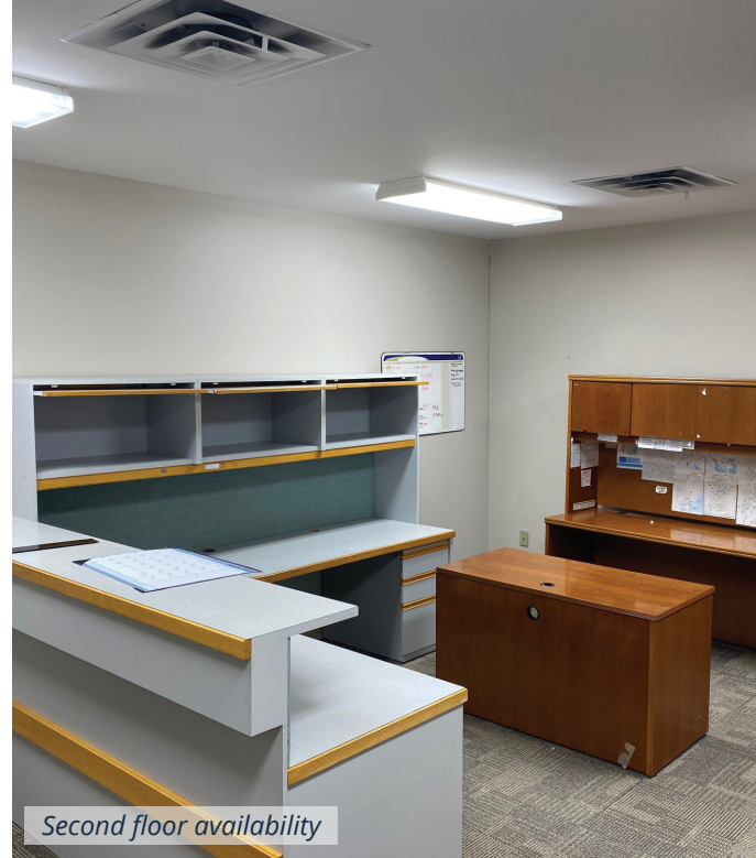
Second floor availability