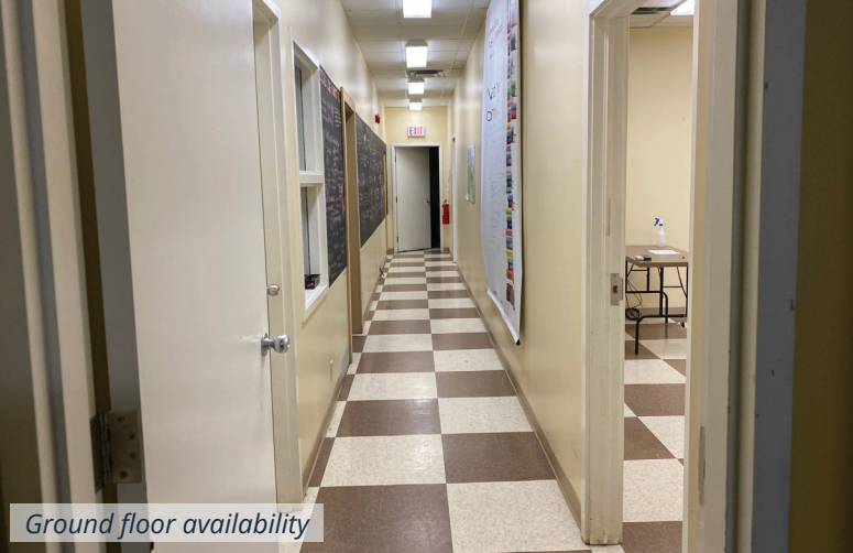
Ground floor availability