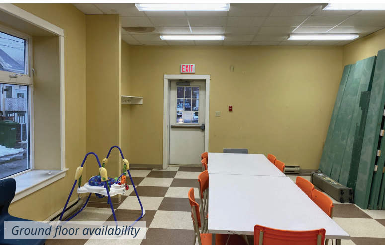
Ground floor availability