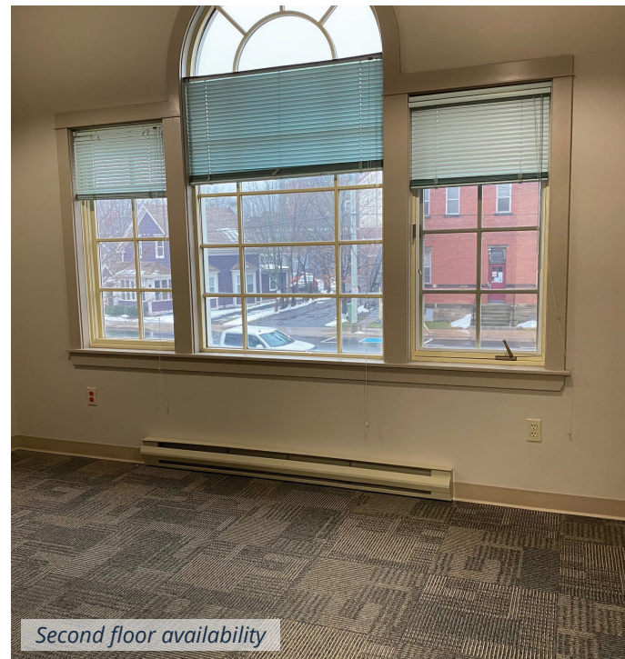
Second floor availability