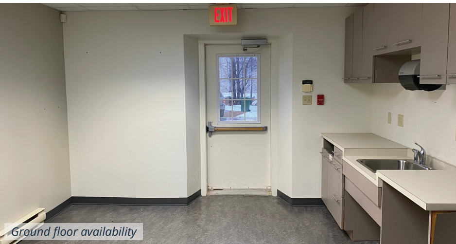
Ground floor availability