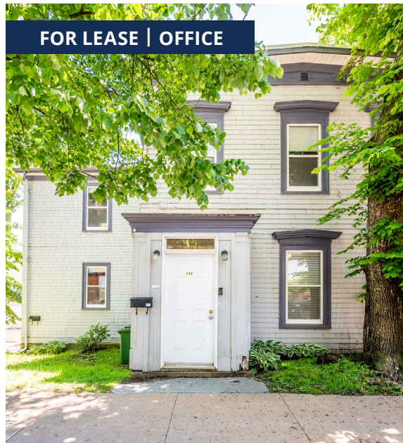
114 OCHTERLONEY STREET, DARTMOUTH