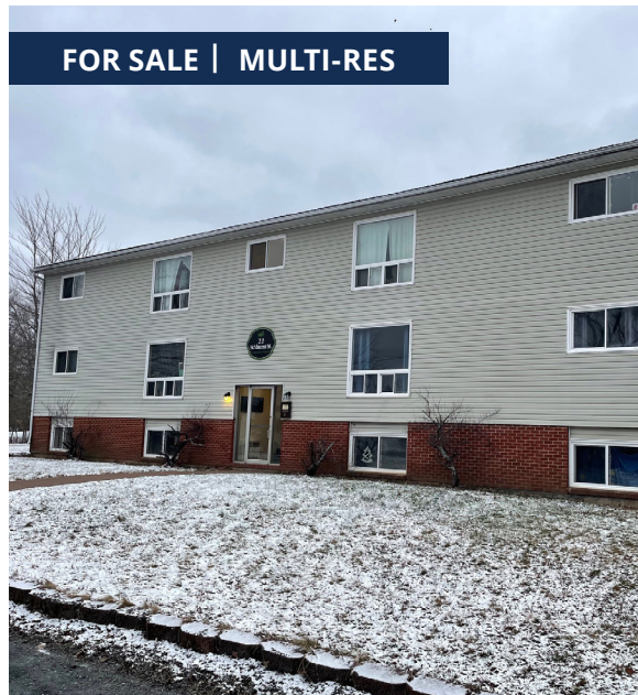
22 ST VINCENT STREET, STELLARTON