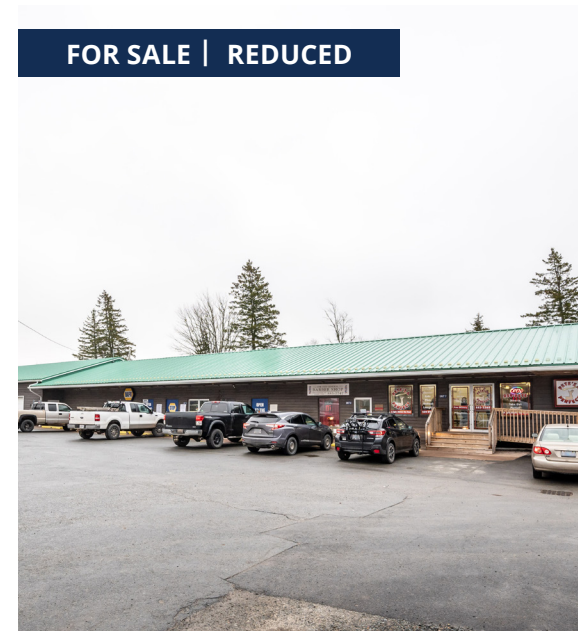
601 HIGHWAY 2, ELMSDALE