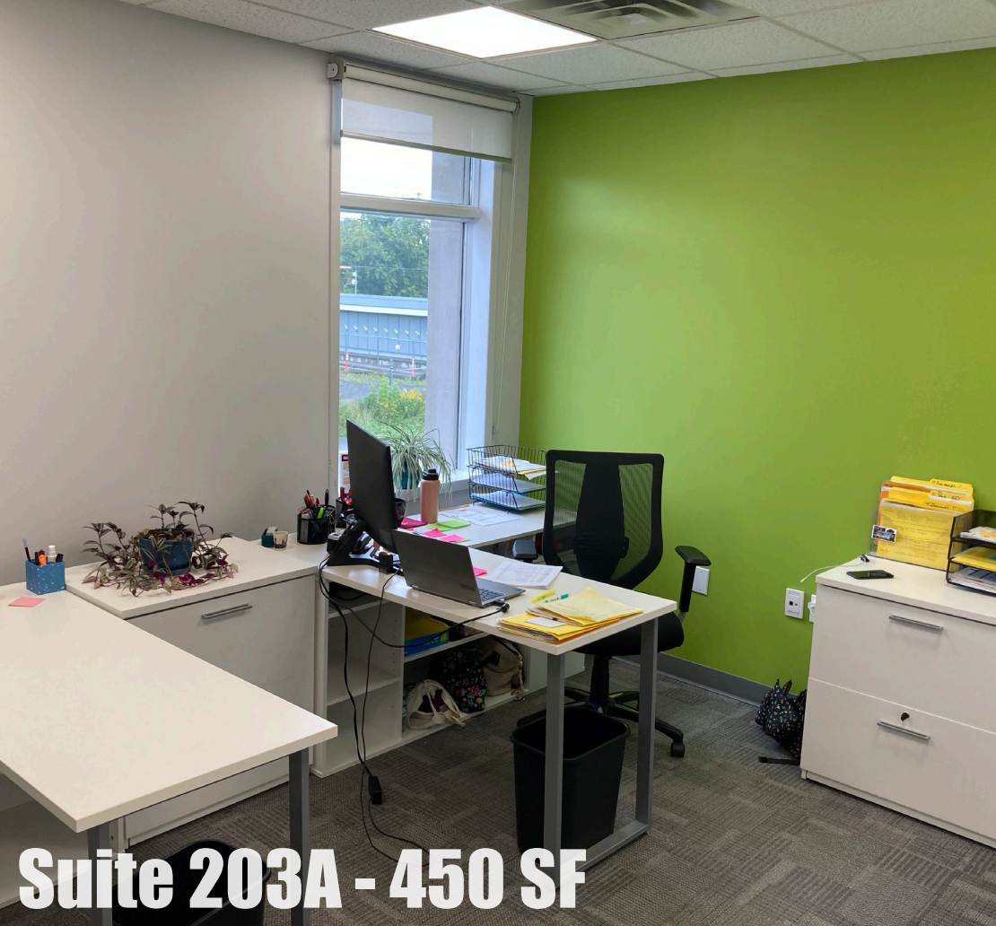
Suite 203A - 450 SF