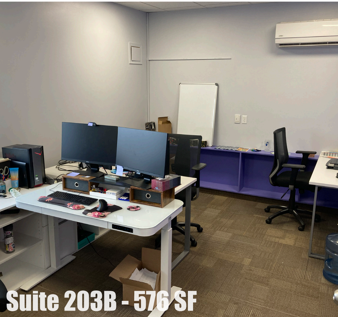
Suite 203B - 576 SF