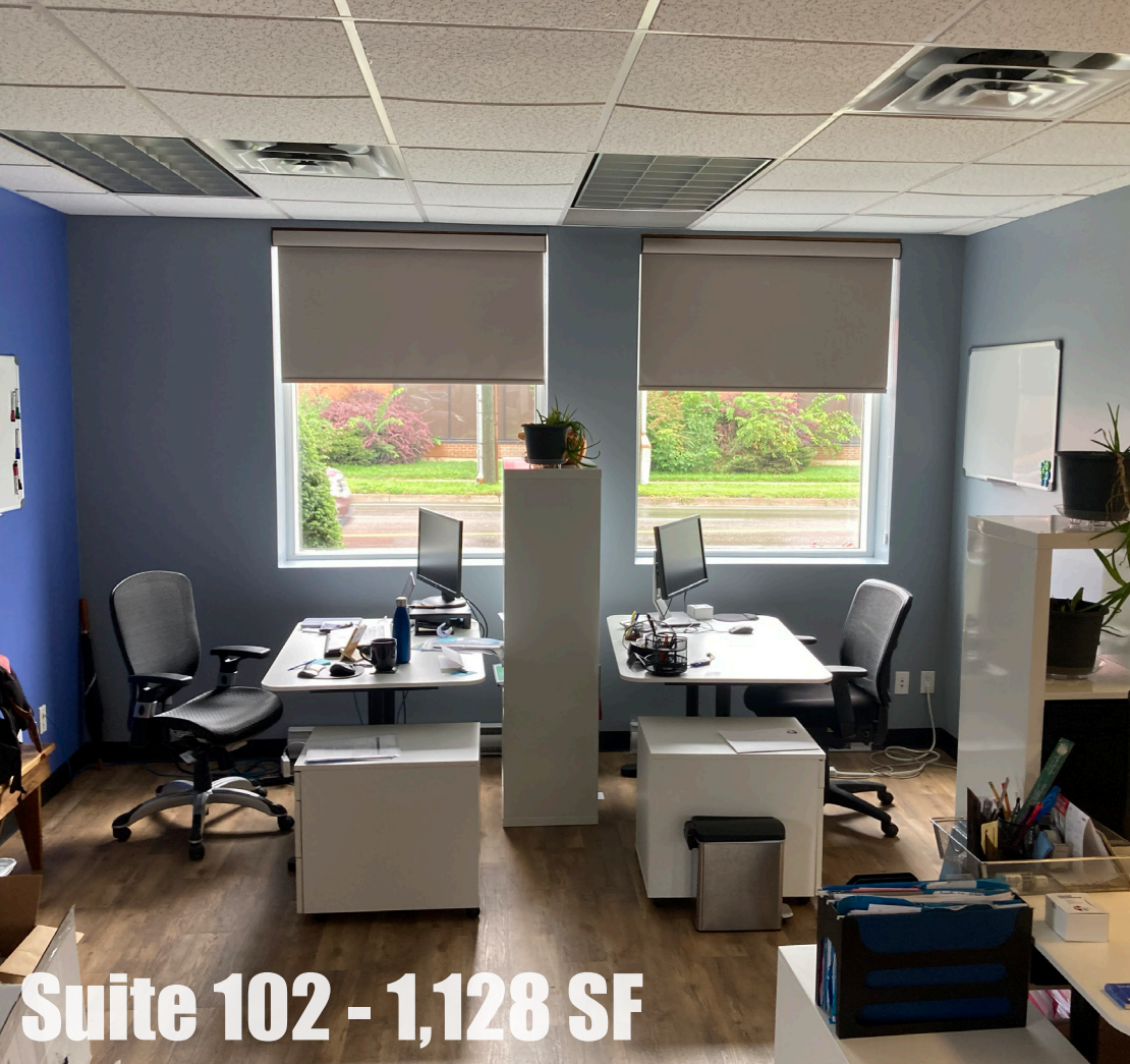
Suite 102 - 1,128 SF