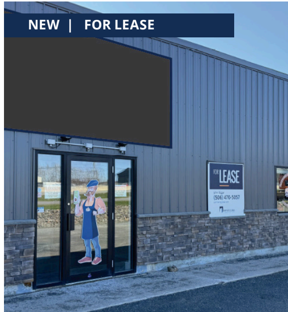
212 HODGSON ROAD, FREDERICTON