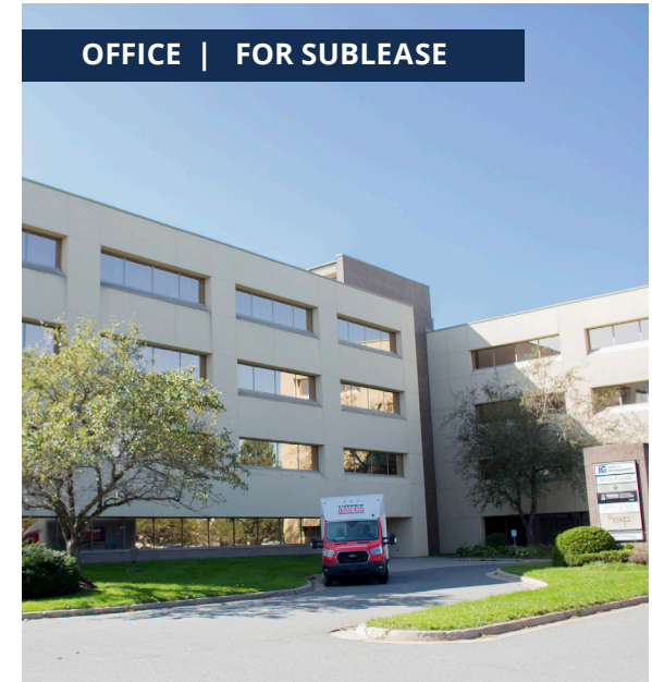
1133 REGENT STREET, FREDERICTON