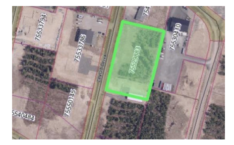
Lot 18-7 Divot Drive, Hanwell