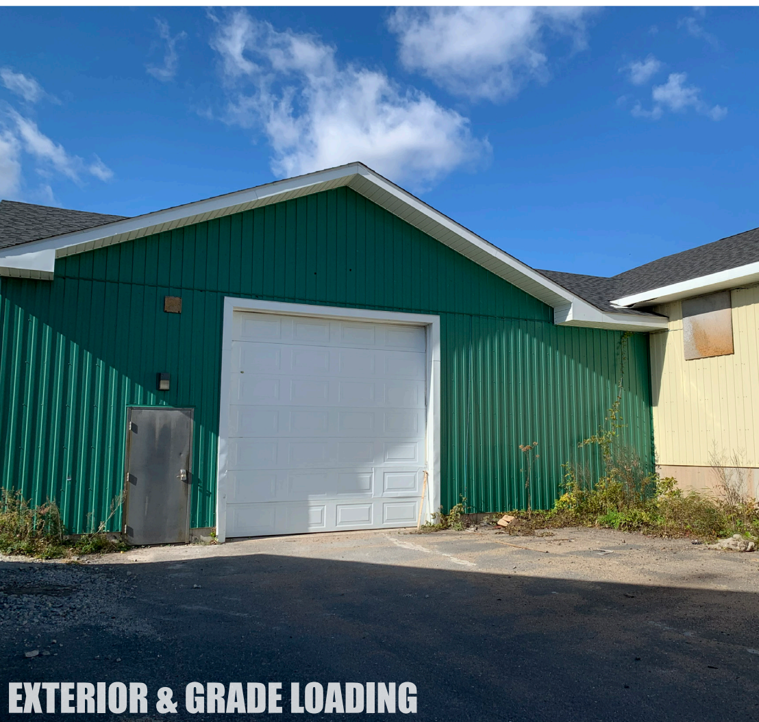
EXTERIOR & GRADE LOADING