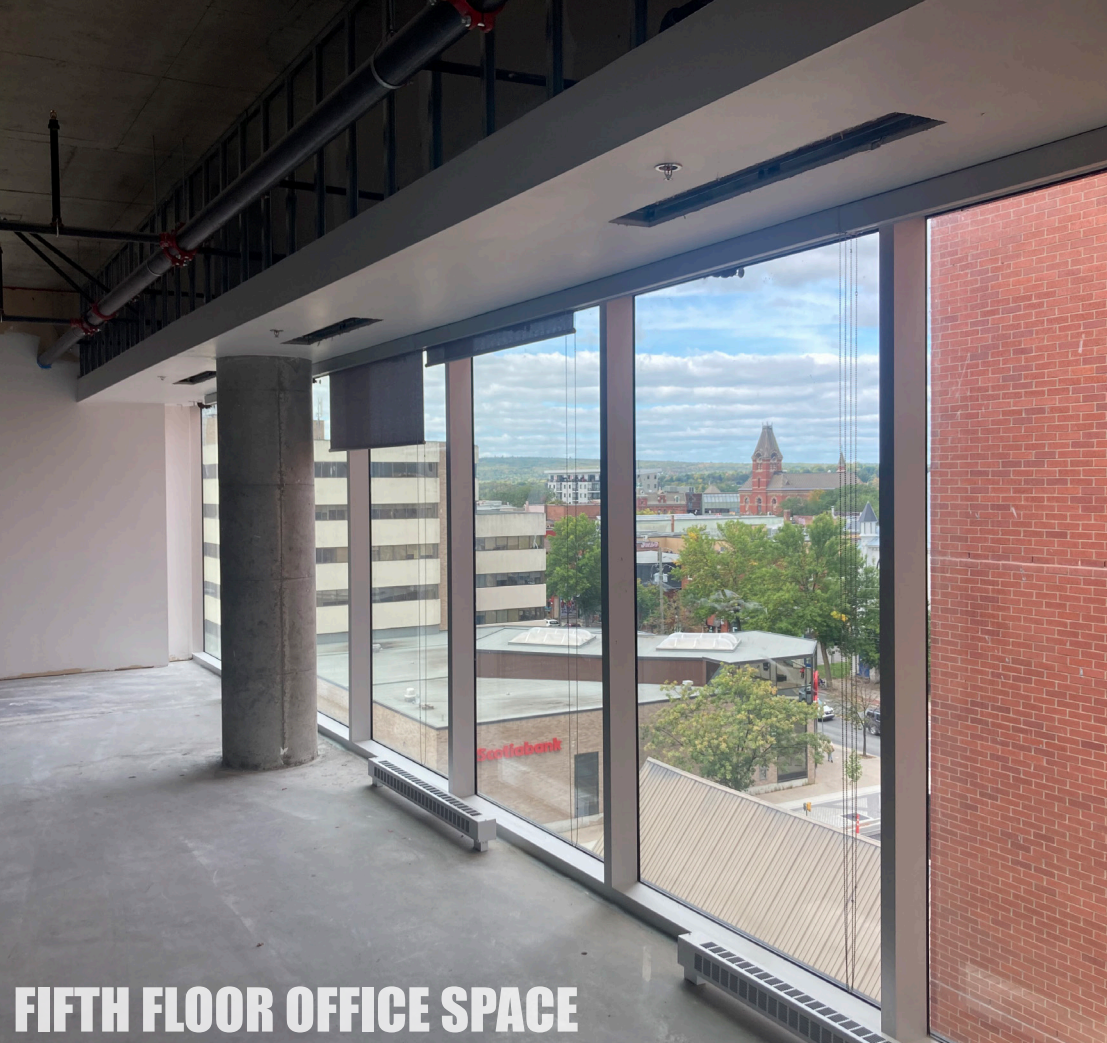
FIFTH FLOOR OFFICE SPACE