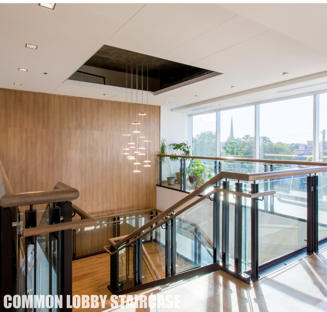
COMMON LOBBY STAIRCASE