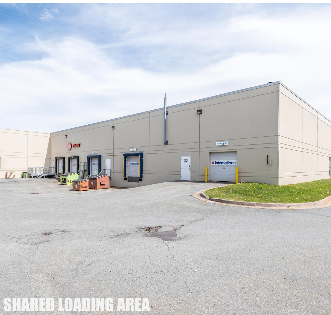
SHARED LOADING AREA