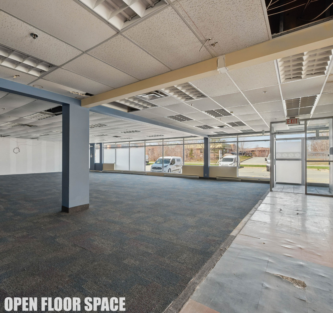
OPEN FLOOR SPACE