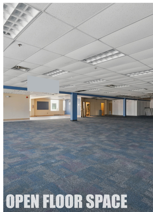
OPEN FLOOR SPACE