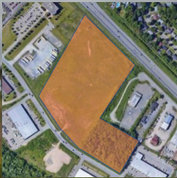
165 & 185 Alison Boulevard 17 acres total