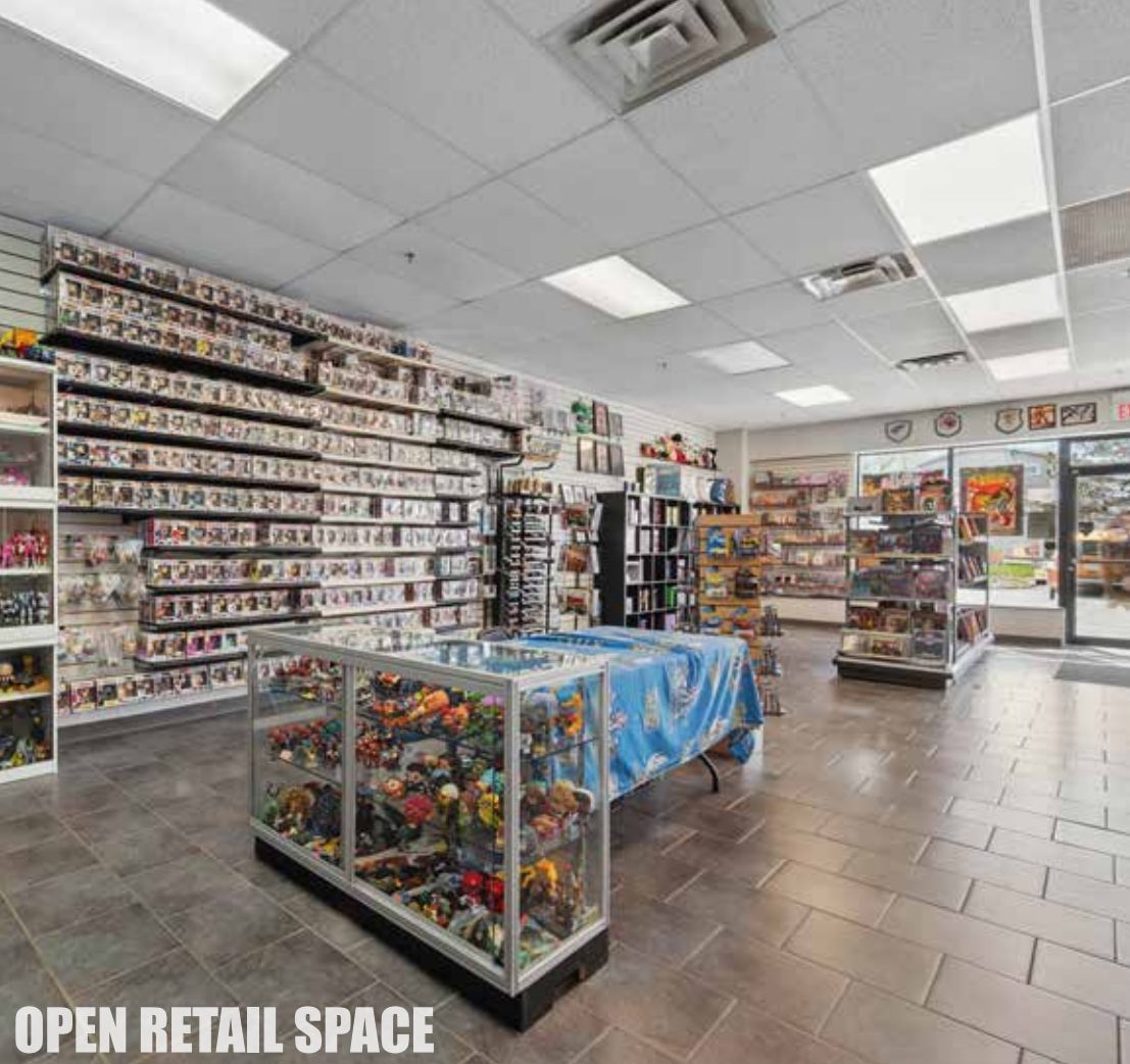
OPEN RETAIL SPACE