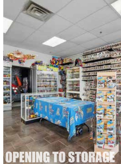
OPENING TO STORAGE