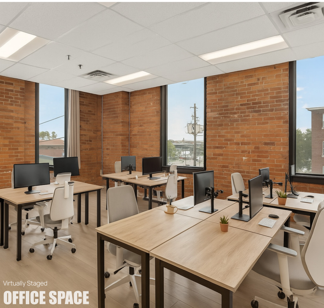
Virtually Staged OFFICE SPACE