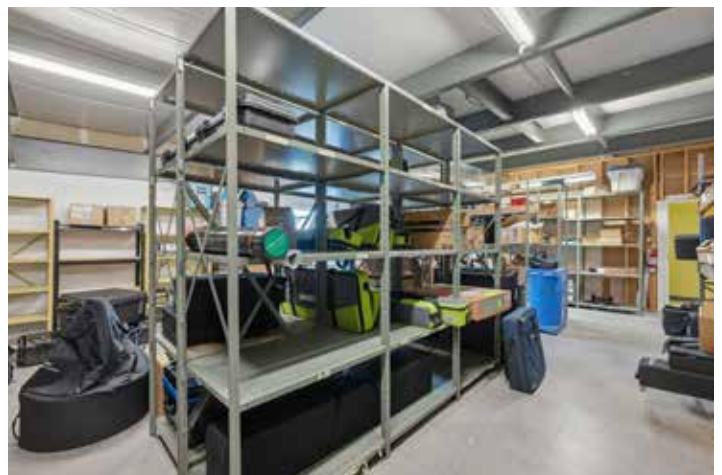
Opportunity to expand to storage room