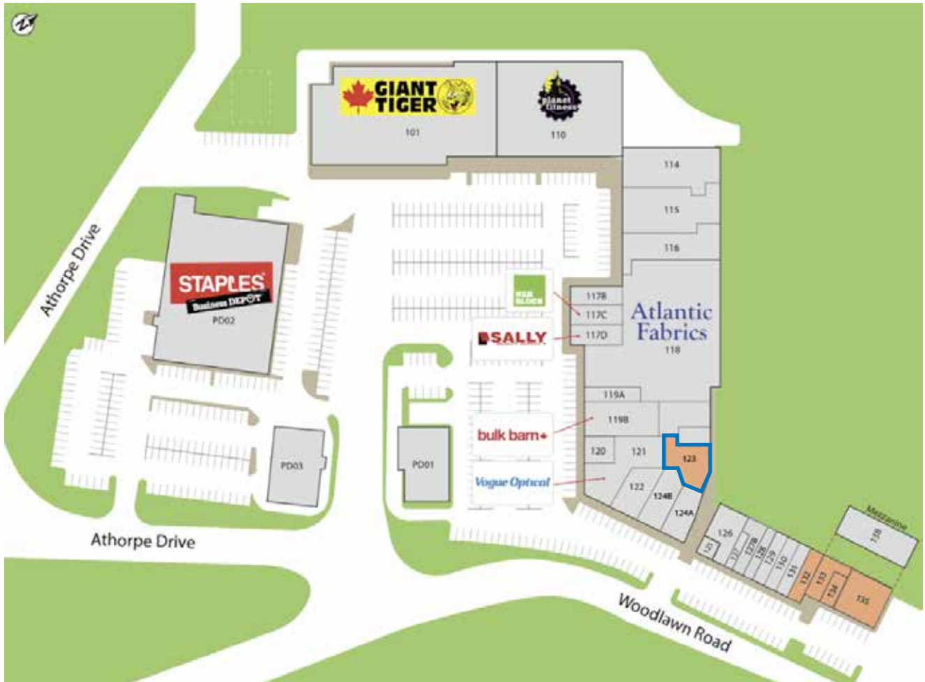
Subject Premises (boundaries are approximate)